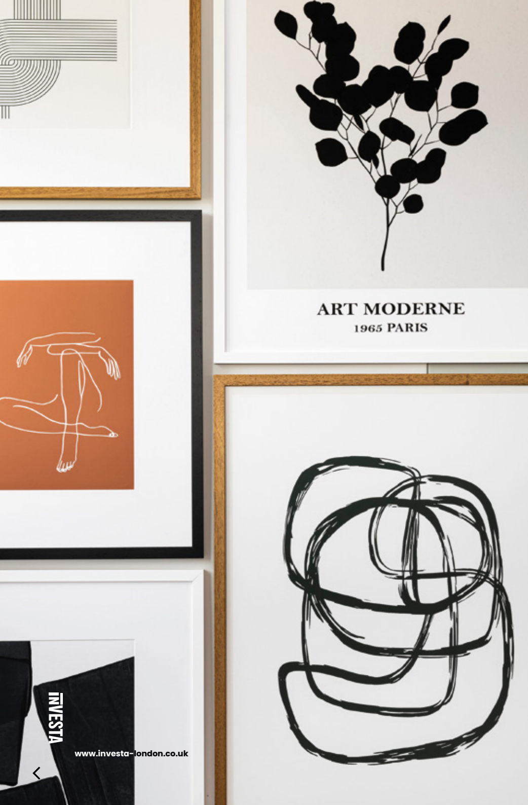
ART MODERNE 1965 PARIS